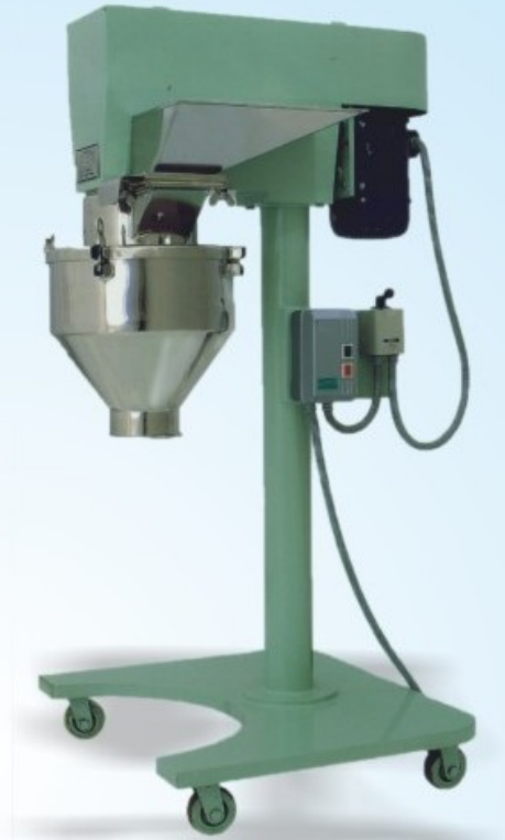
Standard Multi Mill