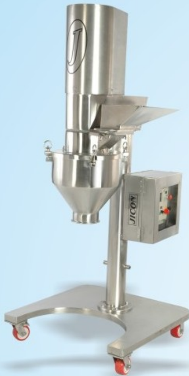
Direct Drive Multi Mill