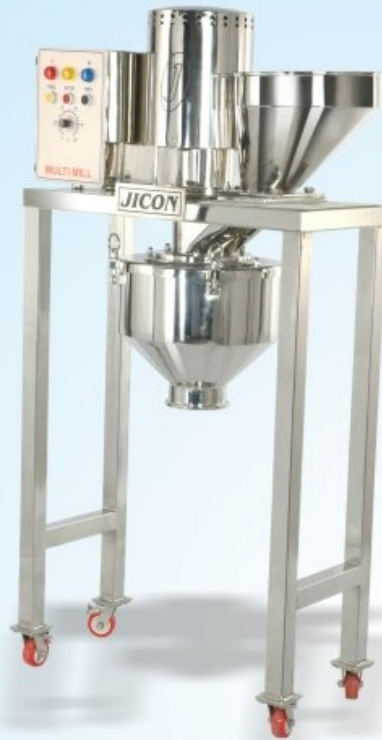
Universal Multi Mill